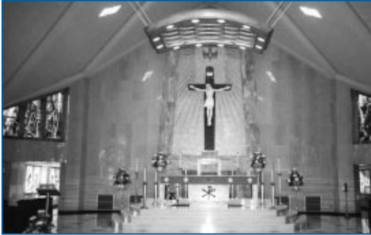
The Motherhouse Chapel at Immaculata, Pennsylvania is dedicated to the Sacred Heart.