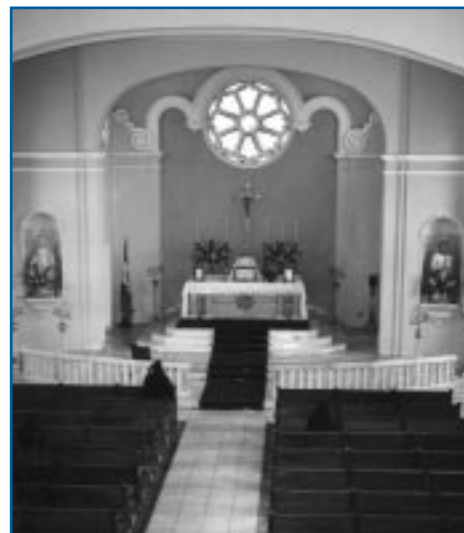
The Chapel at EIC (Escuela Inmaculado Corazon) in Miraflores, Peru was the model used for the Chapel at Camilla Hall