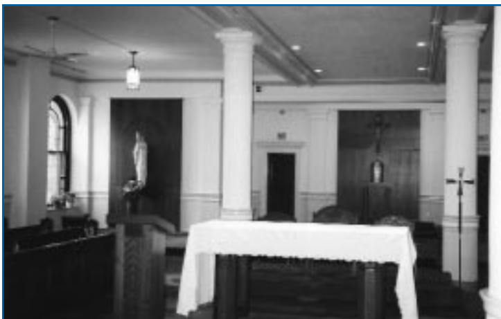
The Blessed Mother shrine in Immaculata University’s Chapel is a favorite prayer spot for students, faculty and sisters alike.

We would like to introduce you to some of our “dearest spots.”